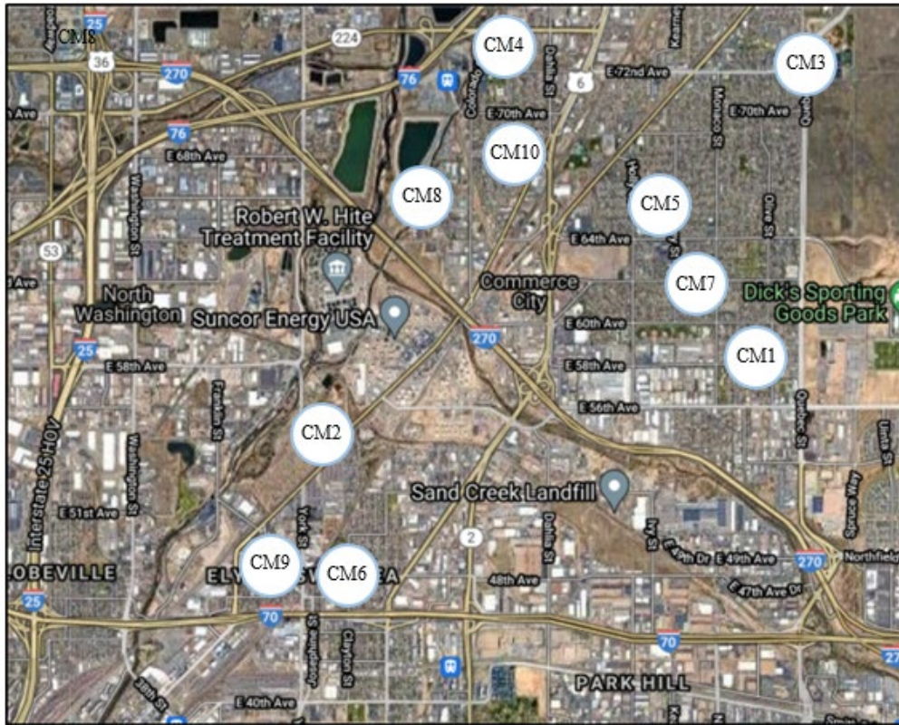
FIGURE 1-1 MAP OF TEN CCND MONITOR LOCATIONS